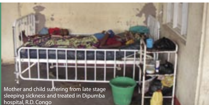
Mother and child suffering from late stage sleeping sickness and treated in Dipumba hospital, R.D. Congo